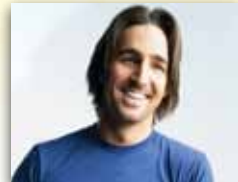
JAKE OWEN "Some Tune" Sun. 9/25 7:30pm