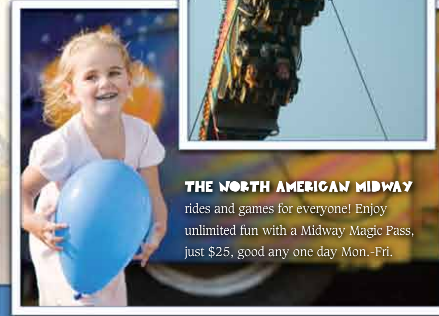
THE NORTH AMERICAN MIDWAY rides and games for everyone! Enjoy unlimited fun with a Midway Magic Pass, just $25, good any one day Mon.-Fri.