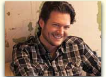
BLAKE SHELTON "Honey Bee" Sat. 10/1, 7:30pm $39/$29