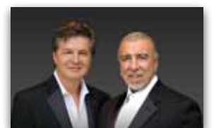
THE BUCKINGHAMS "Kind of a Drag" 9/23-9/27 1 & 6:30pm