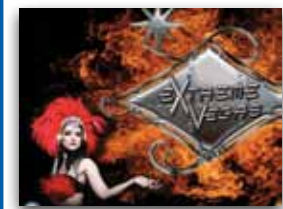
EXTREME VEGAS Mesmerizing Illusions & Stunts Daily at 11am, 3 & 8pm The Court of Honor Stage is an outdoor venue with limited seating available. All shows are free.