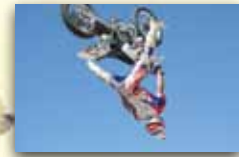
U.S. FREESTYLE MOTOCROSS NATIONAL CHAMPIONSHIP SERIES Fri. 9/16, 7:30pm Sat. 9/17, 2 & 7:30pm Sun. 9/18, 2 & 7:30pm

Reserve premium seating for select Free Shows — only $25 (Includes admission to The Big E). Details at TheBigE.com