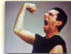
BOWZER'S ROCK & ROLL PARTY With Lou Christie, Gary U.S. Bonds & more. Sat. 9/24, 7:30pm