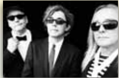
AN EVENING WITH CHEAP TRICK "I Want You to Want Me" Fri. 9/30, 7:30pm