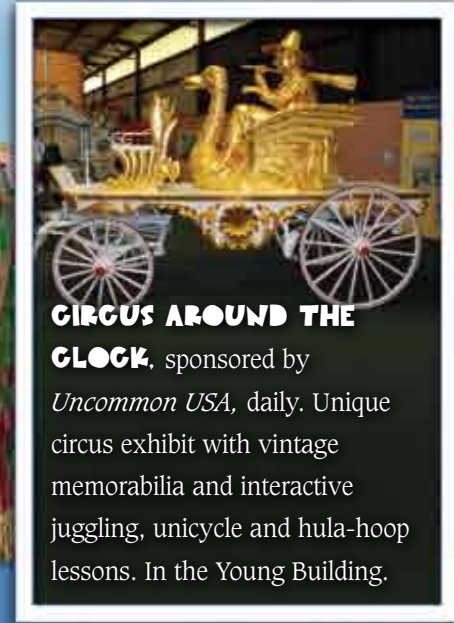
CIRCUS AROUND THE CLOCK. sponsored by Uncommon USA , daily. Unique circus exhibit with vintage memorabilia and interactive juggling, unicycle and hula-hoop lessons. In the Young Building.