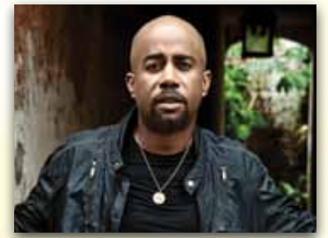
DARIUS RUCKER "I Got Nothin'" Fri. 9/23, 7:30pm $39/$29

ON THE COMCAST ARENA STAGE: Comcast. Comcast Arena Stage is an outdoor venue with limited seating available. Buy tickets at TheBigE.com . All exhibits and concerts are subject to change.